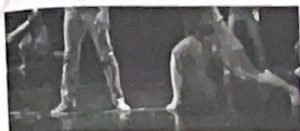
BODYTRAFFIC - ONE OF L.A.'S FINEST CONTEMPORARY DANCE ENSEMBLES