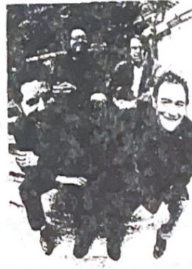
Wilco will perform at All Tomorrow's Parties, a four-day alternative music festival that begins Thursday at UCLA