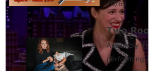
Phoebe Waller-Bridge Talks Filming 'Fleabag' in Los Angeles