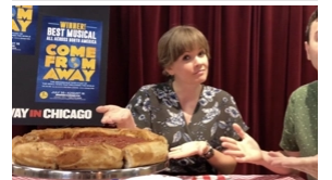
COME FROM AWAY's Becki Welcomes Chicago To The